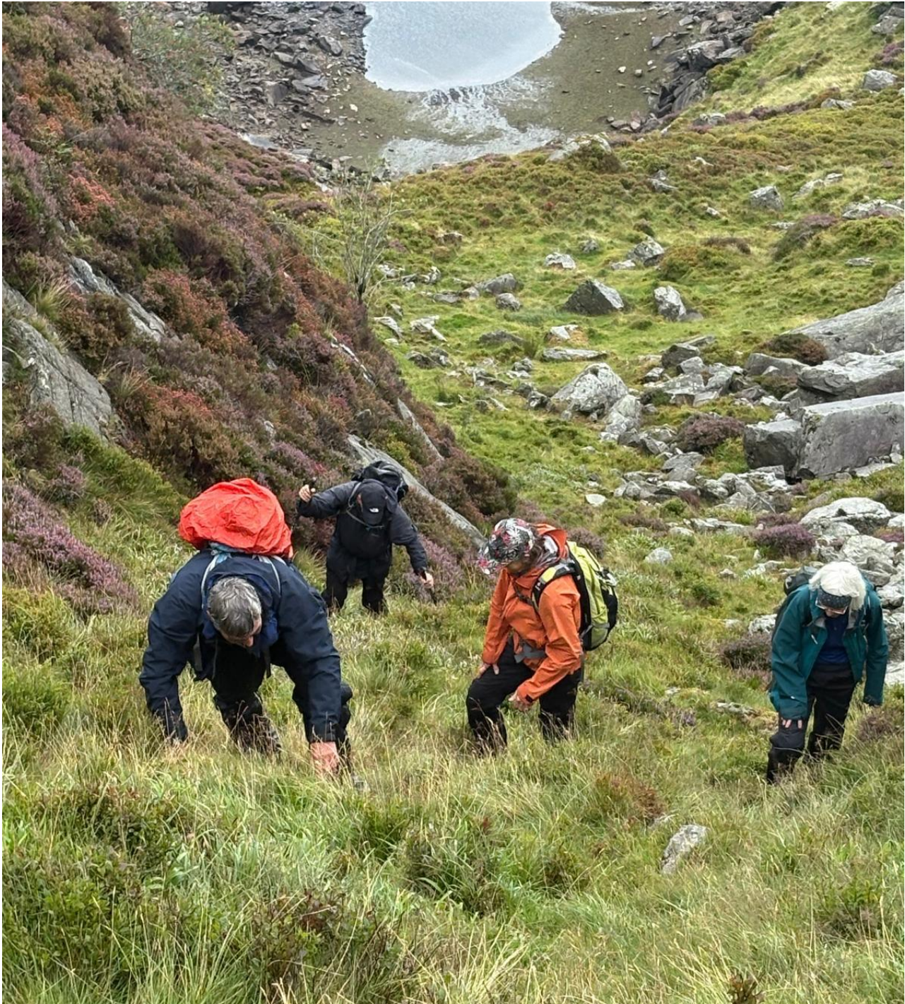
The going gets tough above the Dulyn reservoir

From the reservoir it was a steep and trackless pull up to the summit of Foel Grach. From here the weather started to improve and we continued along the Carnedd ridge taking in the summits of Carnedd Gwennllian, Foel Fras and Drum. We were treated to a distant sighting of the Isle of Man with the peak of Snaefell quite clearly visible, which given the distance is probably quite unusual.