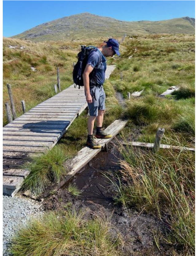
... and dares to test one of the old boardwalk planks