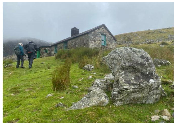
The bothy near the Dulyn reservoir