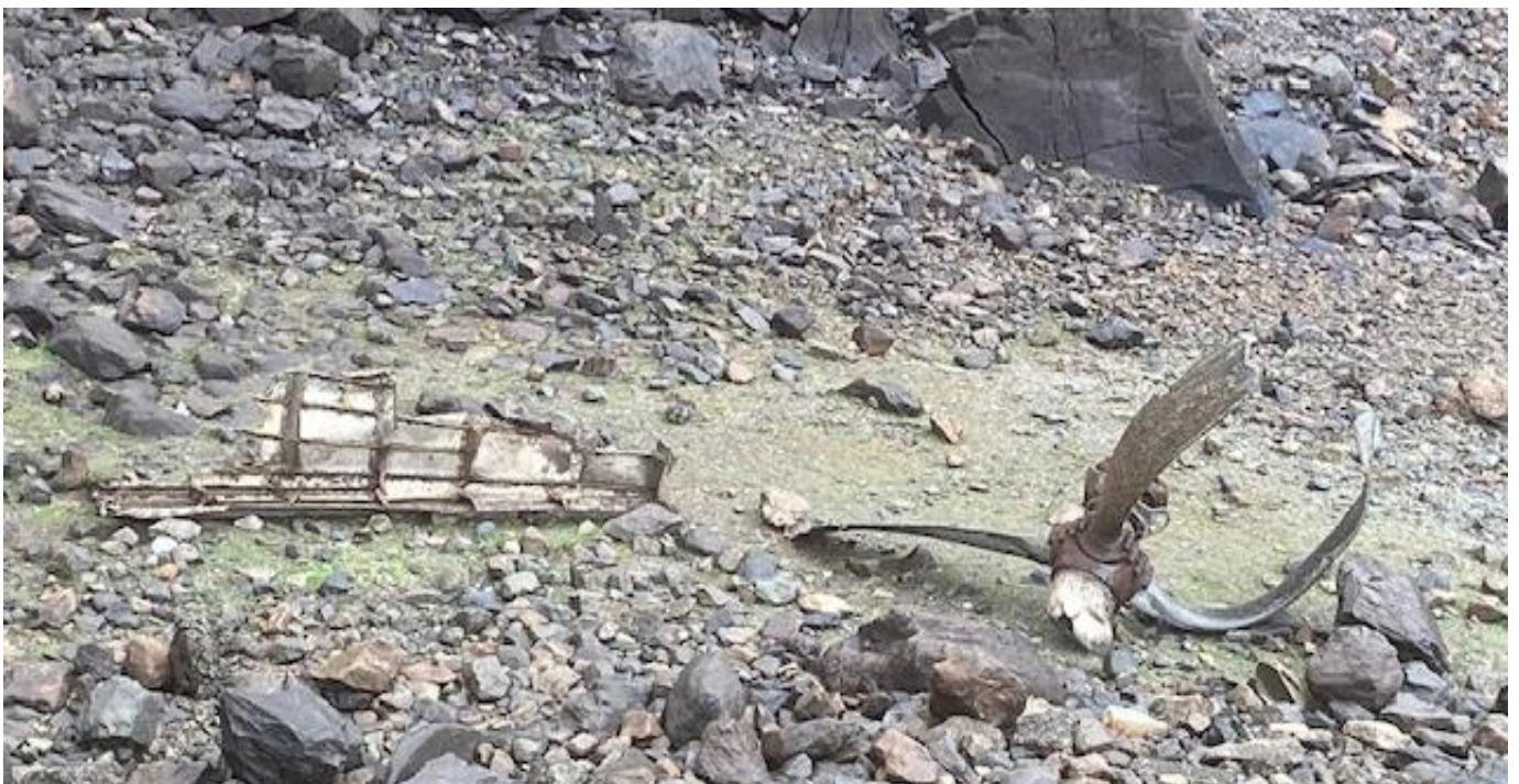
The macabre remains of the crashed Dakota aircraft which flew into a nearby cliff in 1944